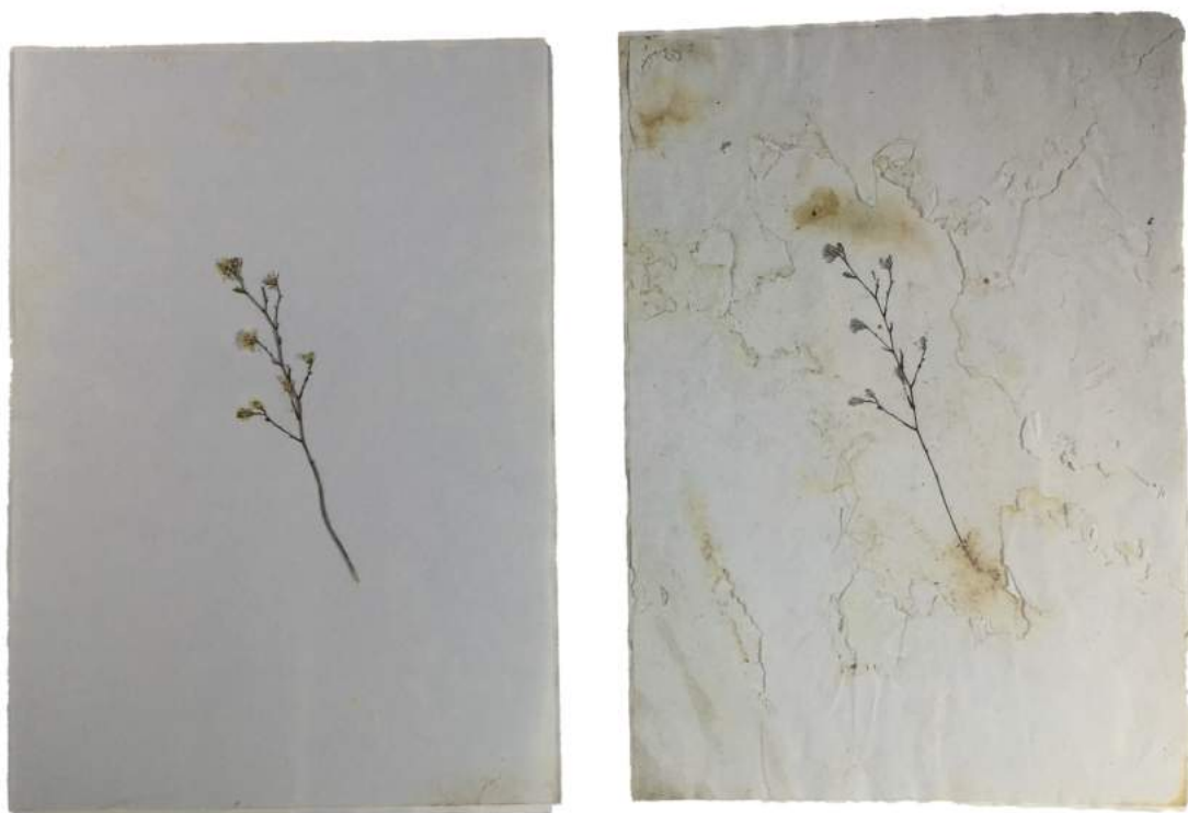
Ricardor Calero, Natural Luz, Diptych, 29,7 x 21cm each