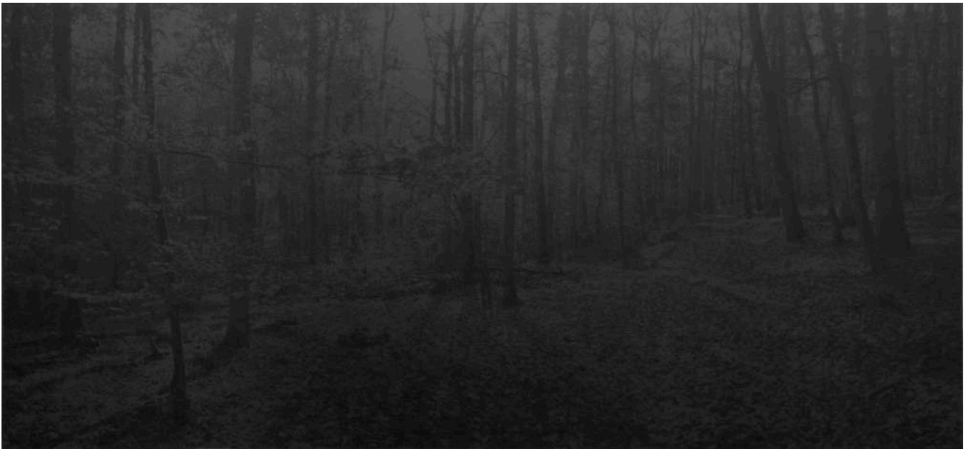
Andreas Walther, Unnamed #2/ 2016, Pigment Ink on Drawingpaper, 89 x 180cm