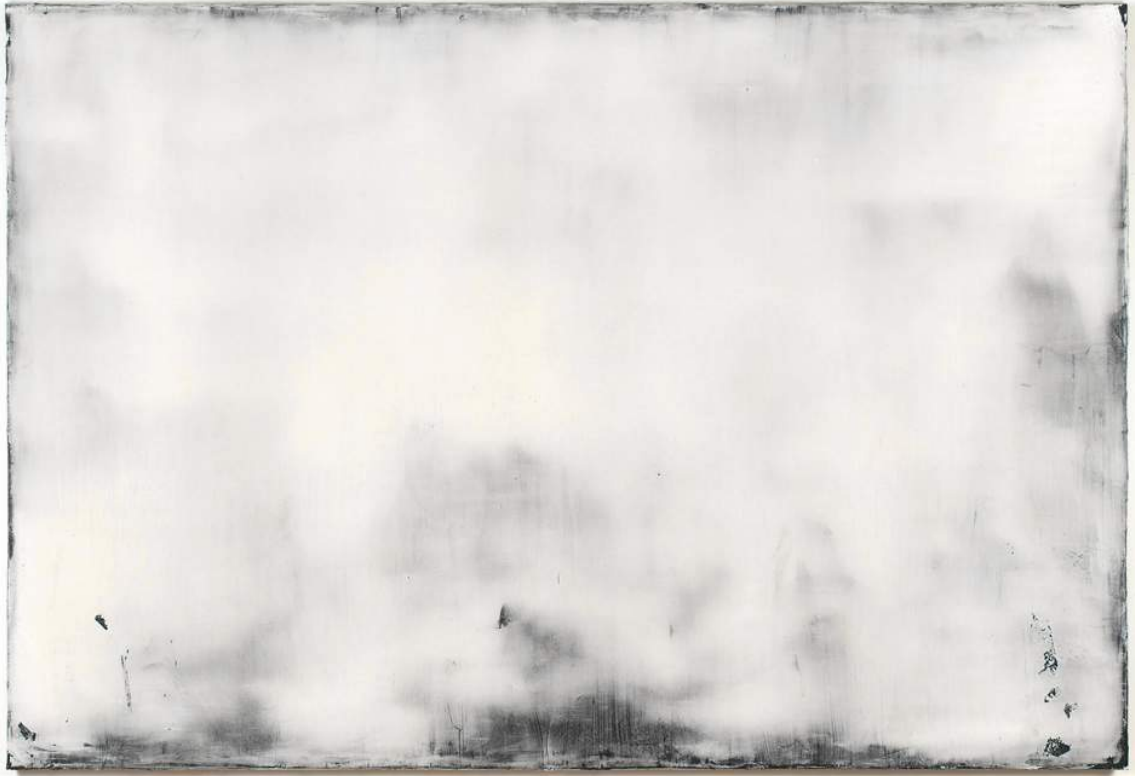
YAMANOBE Hideaki, White Landscape No.1 Acrylic on Nettle, 2008, 170 x 250 x 5 cm