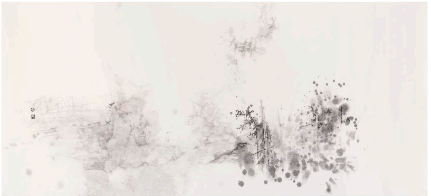
JIANG Sanshi, EPPSTEIN 20140707, 96 x 215 cm, Tusche auf Reispapier