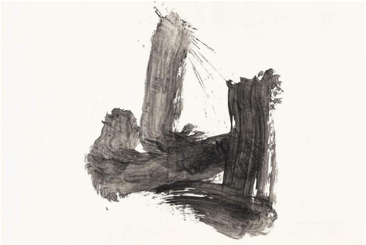
Inoue Yu-ichi (井上有一), Mountain (山), Ink on Japan Paper, 146 x 244cm